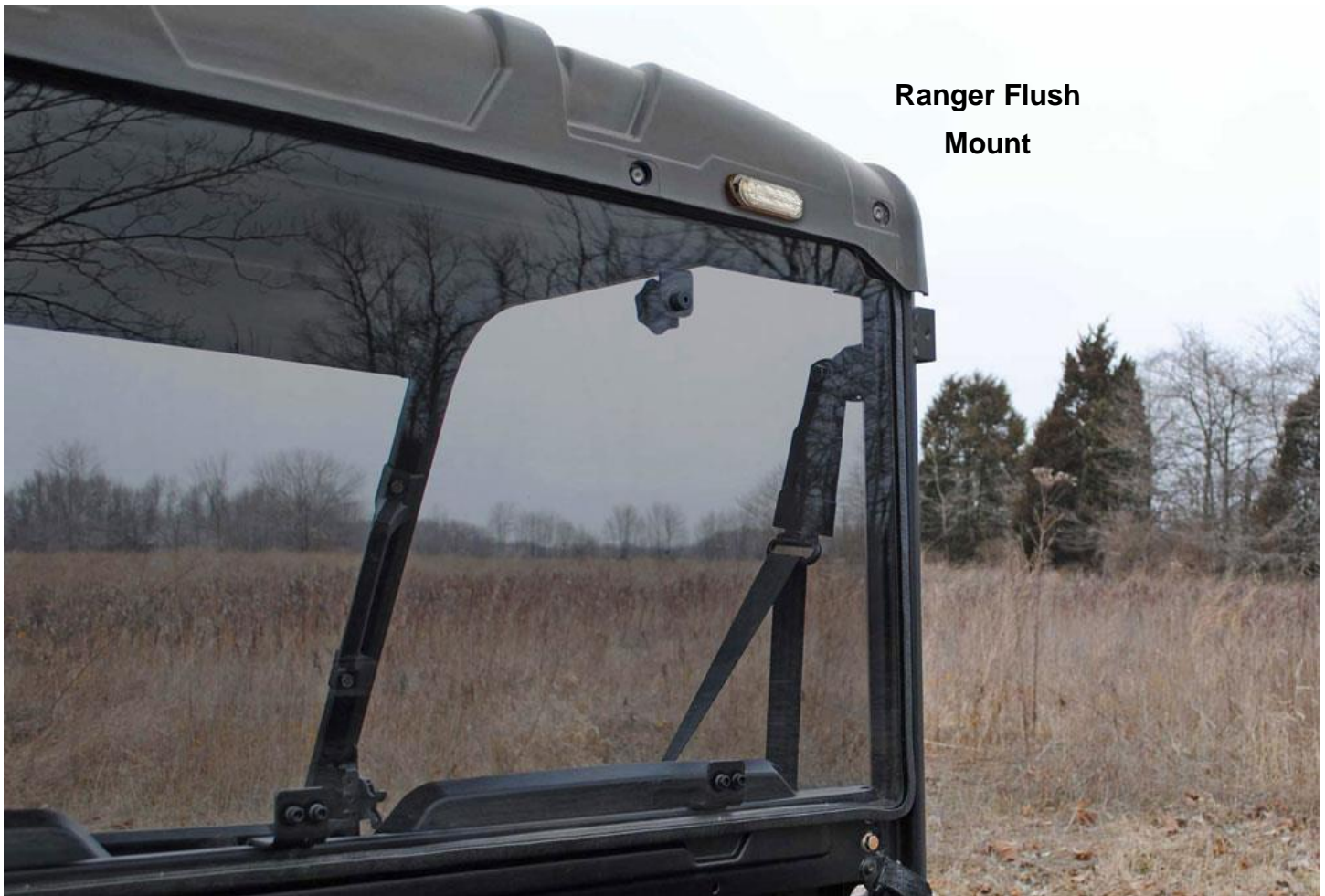
Ranger Flush Mount