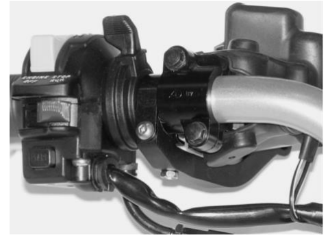
Right side view of ATV - bracket is positioned under brake lever and angles toward center.

STEP 5: Attach the brake side bracket to the strap the same as in STEPS 2 & 3.