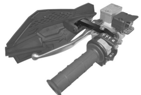
Bracket is positioned over lever.