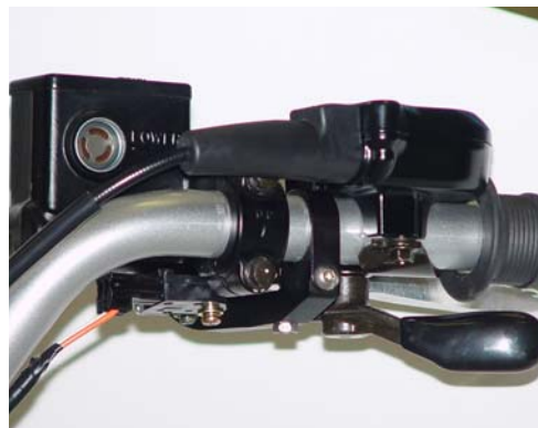
Rear view of ATV throttle, mount bracket is positioned under brake lever.