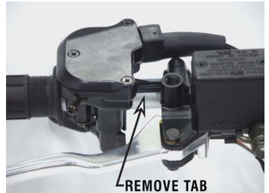
Front view of ATV throttle

STEP 3: Insert the M6 x 25mm hex head bolt through the bracket and thread into the strap. This adjustment screw is used to achieve the desired tightness of the mount. Leave the bracket loose enough for now so you can adjust the position up or down after attaching the hand guard to the bracket.